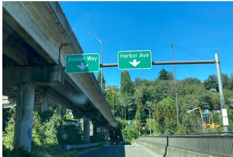
Overhead signage replacement