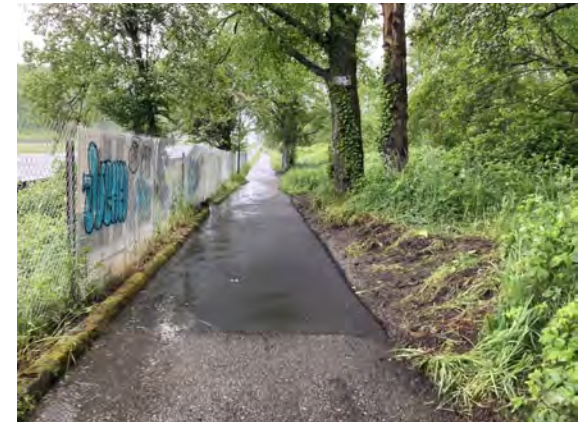
Duwamish Trail pavement repair and trail connection improvements