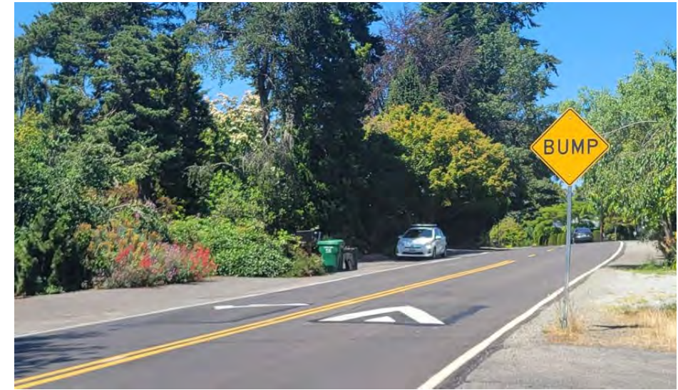
Marine View Dr SW speed cushions