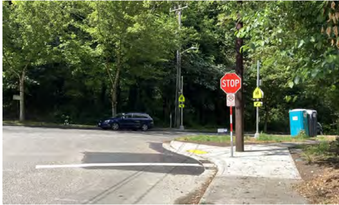
Dumar Way SW and SW Orchard St RRFB