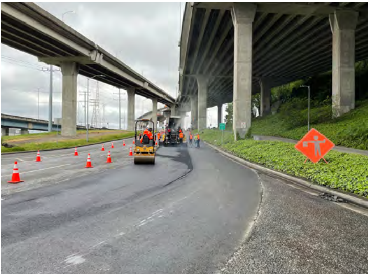
SW Spokane St paving