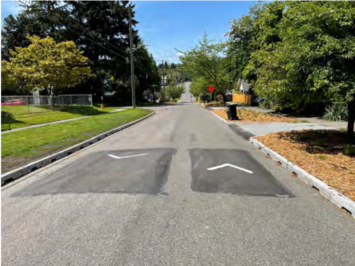
SW Webster St wheel stops and speed cushions