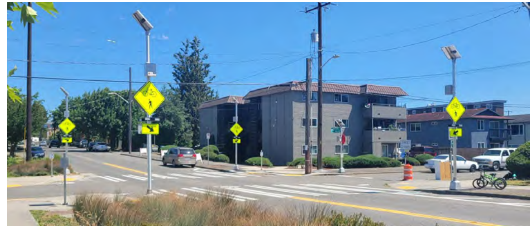
17 th Ave SW and SW Henderson St RRFB