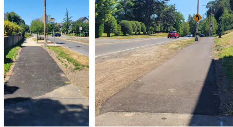
Sylvan Way SW walkway