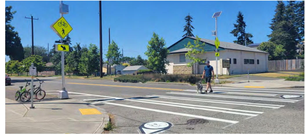
17 th Ave SW and SW Henderson St RRFB